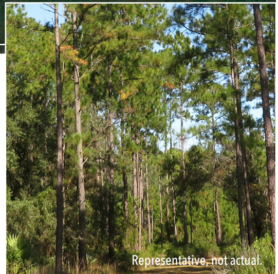
Representative, not actual.

Two 4.8 acre lots in the NE quadrant of Collier Boulevard and I-75. Great land investment, living in nature or hunting/recreational lots. The lots have a future land use designation of Rural Fringe - Sending Lands with a reported potential of 4 TDR credits per lot or 8 total TDR credits. This offering consists of two non-contiguous lots that could be purchased separately. The properties have dirt road access and are located about 6.3 miles east of Collier Blvd and is approximately 20 minutes via White Lake Blvd. The properties are located north (approx. 570' and 1,150') of Blackburn Rd and west (approx 2,720') of Kam Luck Dr.