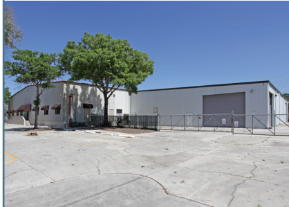
5845 Corporation Cir | Fort Myers

Below please find a number of our teams recent deals and industrial listings for your review.