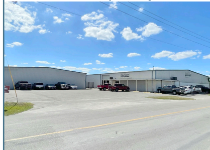
2840 South Street | Fort Myers