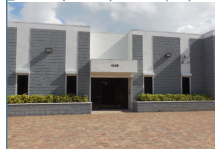
4148 Corporate Square Blvd | Naples