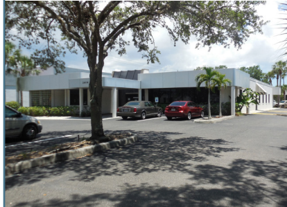
2606 Horseshoe Dr S | Naples