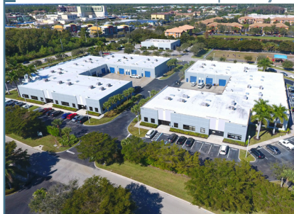
International Business Center | Fort Myers