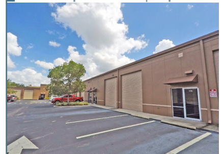
4750 Enterprise Avenue | Naples