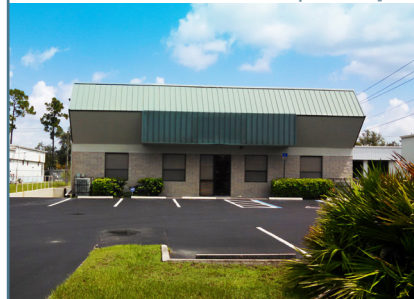
6261 Metro Plantation Rd | Fort Myers