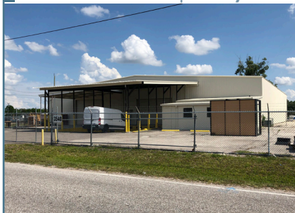
3534 & 3540 Canal St | Fort Myers