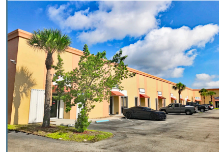
13850 Treeline Ave S | Fort Myers