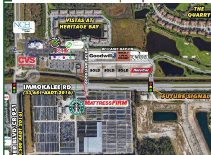
Cameron Commons | Naples