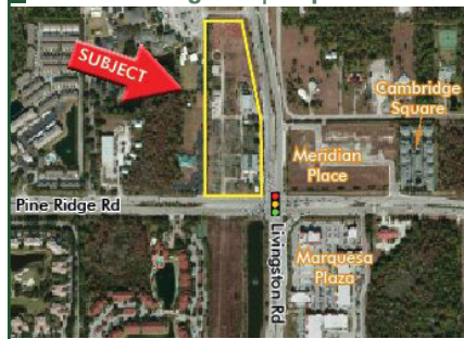
3295 Pine Ridge Rd | Naples