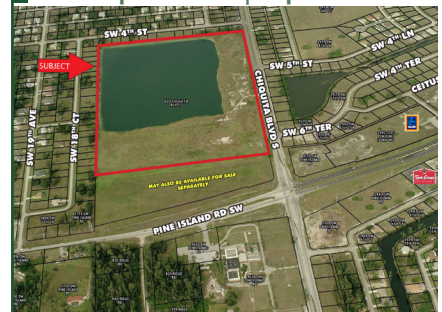
600 Chiquita Blvd S | Cape Coral