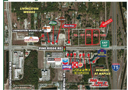
Pine Ridge Rd & I-75 | Naples