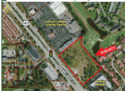
4001 Tamiami Trail E | Naples