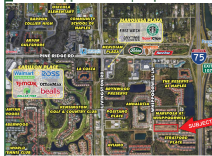
1450 Whippoorwill Ln | Naples