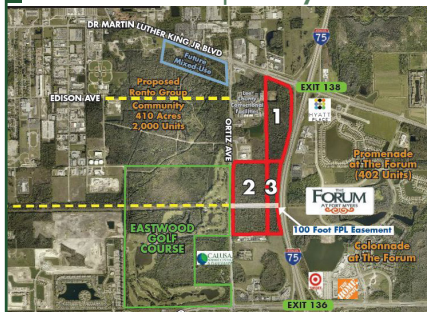
5350 Dr MLK Blvd | Fort Myers

Below please find a number of our teams' recent deals and land listings for your review.